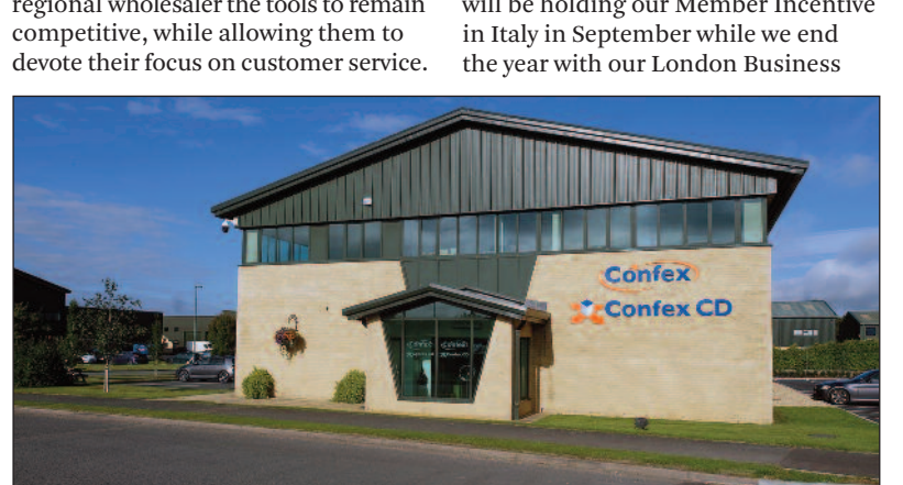
▲ The Confex Head Office.